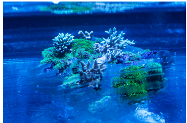
Images: Glenn Kaino, TANK , 2014. Installation view: Prospect.3: Notes for Now , New Orleans, LA.